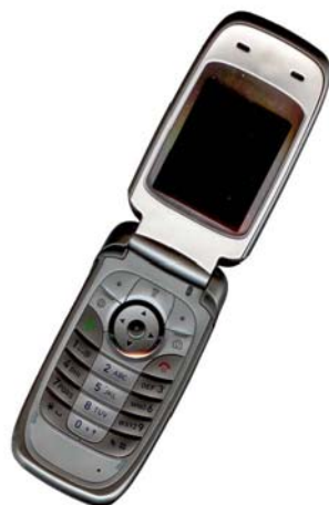
Fig. 3. Example of an image with acceptable resolution