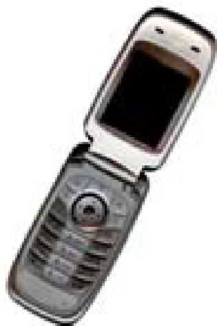
Fig. 2. Example of an unacceptable low-resolution image