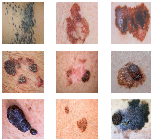
Fig 2. Sample Input Image Dataset

The performance of the results analyzed in terms of accuracy, sensitivity and specificity metrics. These three terms are defined as follows: